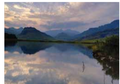
The region along the N3 offers exceptional opportunities and itineraries for exploring.

For more information visit stand DEC 1B40.