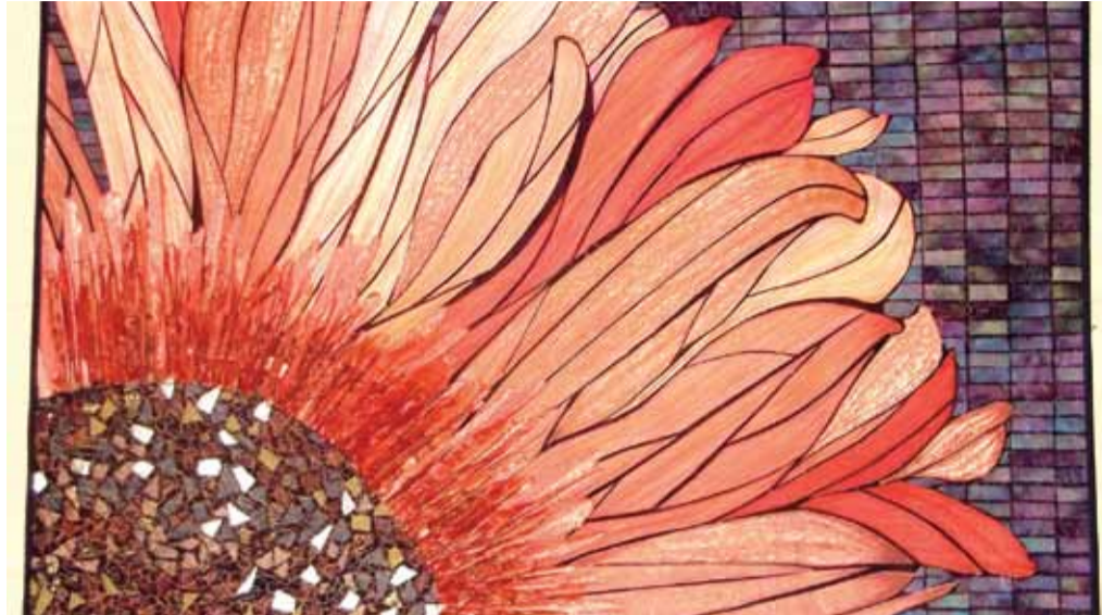
Mossel Bay art can now be viewed digitally on a dedicated platform developed in South Africa specifically for tourism businesses.

Mossel Bay Tourism's new art route is a digital affair.