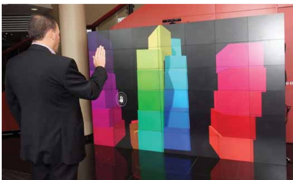
The tourism connector puts fun into doing tourism business.