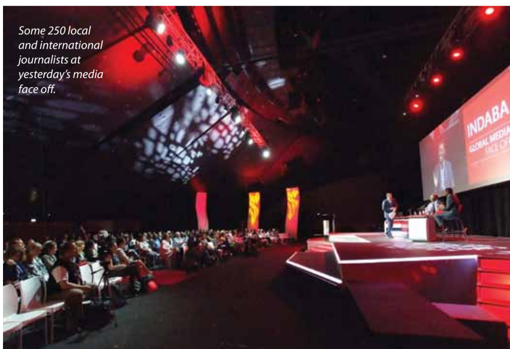
Some 250 local and international journalists at yesterday's media face off.