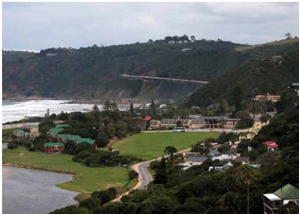
The view from The Wilderness Hotel is but a small taste of what the area has to offer.

The Wilderness Hotel – one of the Garden Route’s oldest and best-loved properties – reopened March 31 after a hiatus of nearly thirty months.