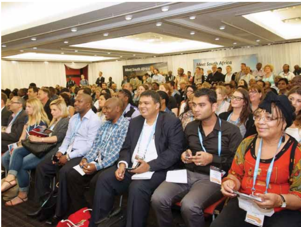
Speed marketing as popular as ever.