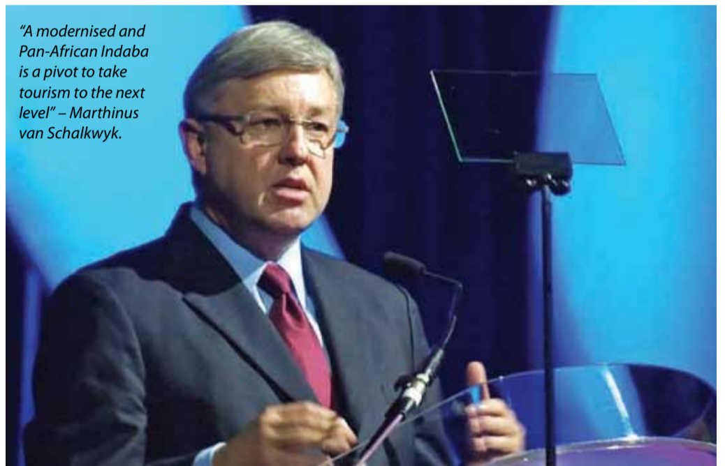
"A modernised and Pan-African Indaba is a pivot to take tourism to the next level" – Marthinus van Schalkwyk.

"From the side of the tourism industry, our message is a resounding one – what an exhilarating 20 years it has been!" said Van Schalkwyk.