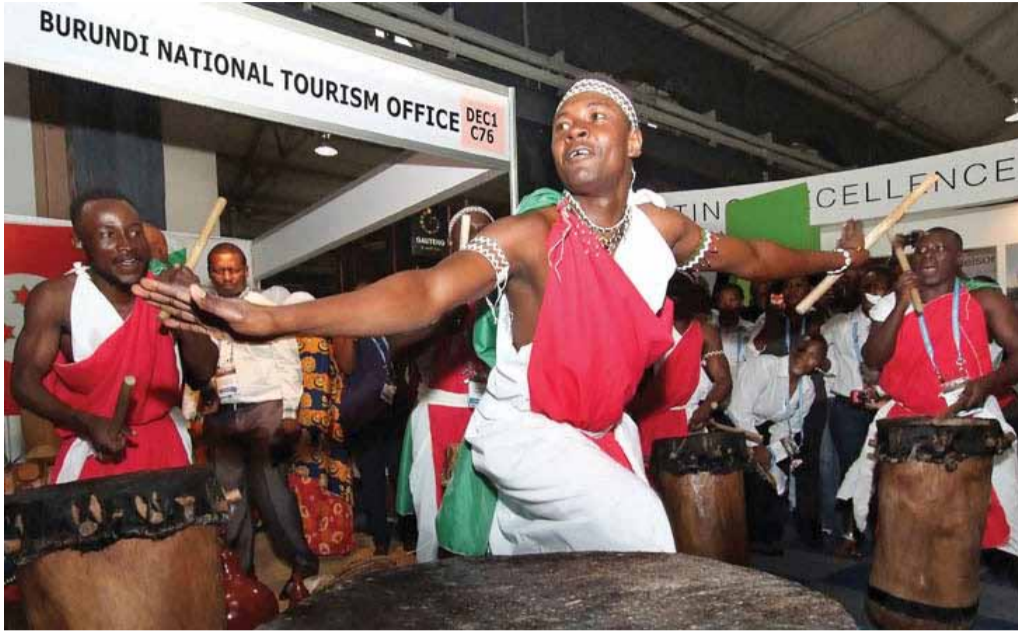
Beating Burundi's drum.