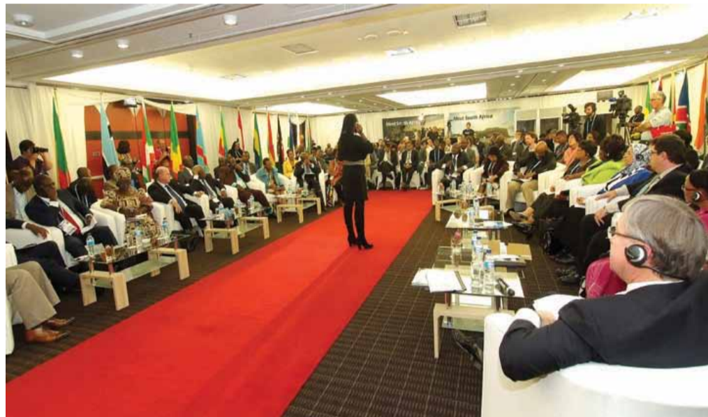
The Indaba 2014 ministerial roundtable – working on joint strategies to promote tourism in Africa.

“Africa’s key priorities are to move even faster to liberalise air policies and create an intra-continental air transport architecture that facilitates intra-African travel and trade,” said the South African Minister of Tourism, Marthinus van Schalkwyk.