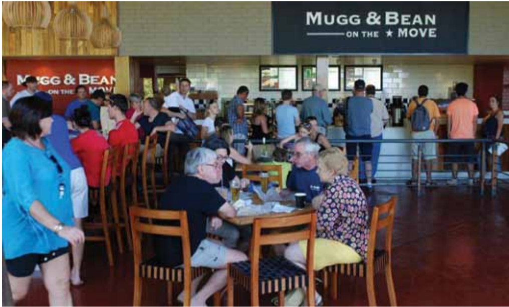
Lower Sabie Mugg & Bean On The Move during a busy lunchtime rush.

Two months after the opening of the Mugg & Bean restaurant at Lower Sabie in the Kruger National Park there has been a 127 percent increase in turnover.