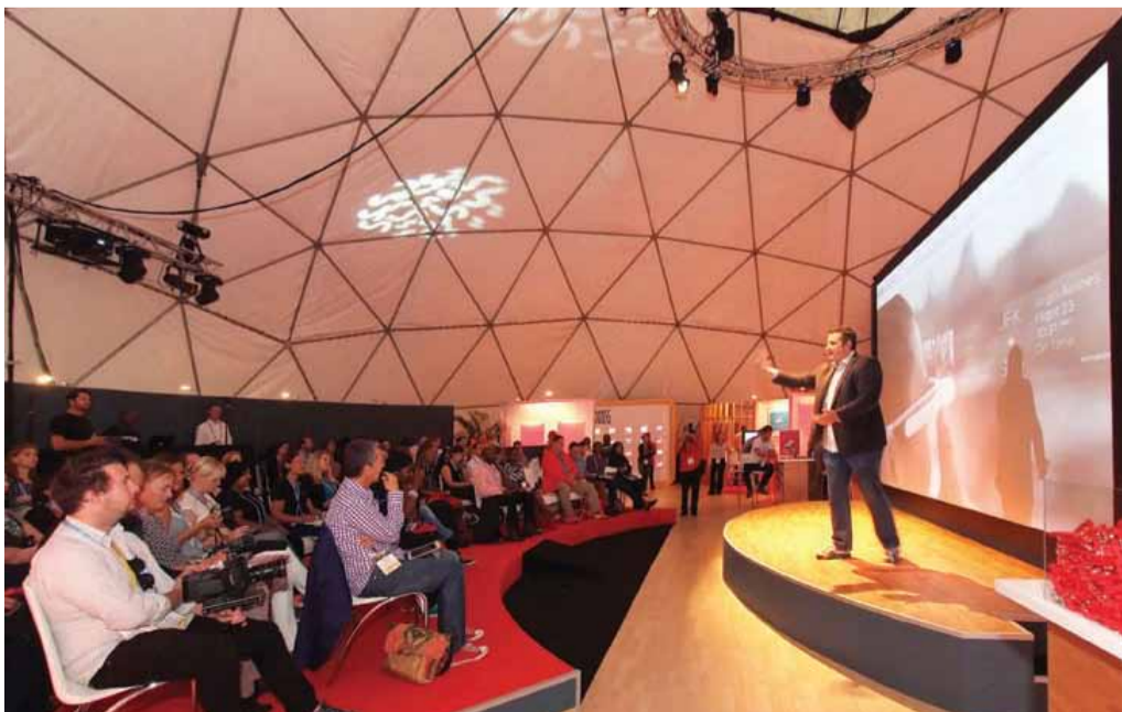
The TechZone – giving travel technology its own home.