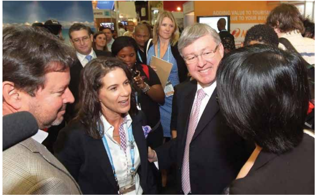
Walking the talk – South African Tourism Minister Marthinus van Schalkwyk meets with members of the travel trade.