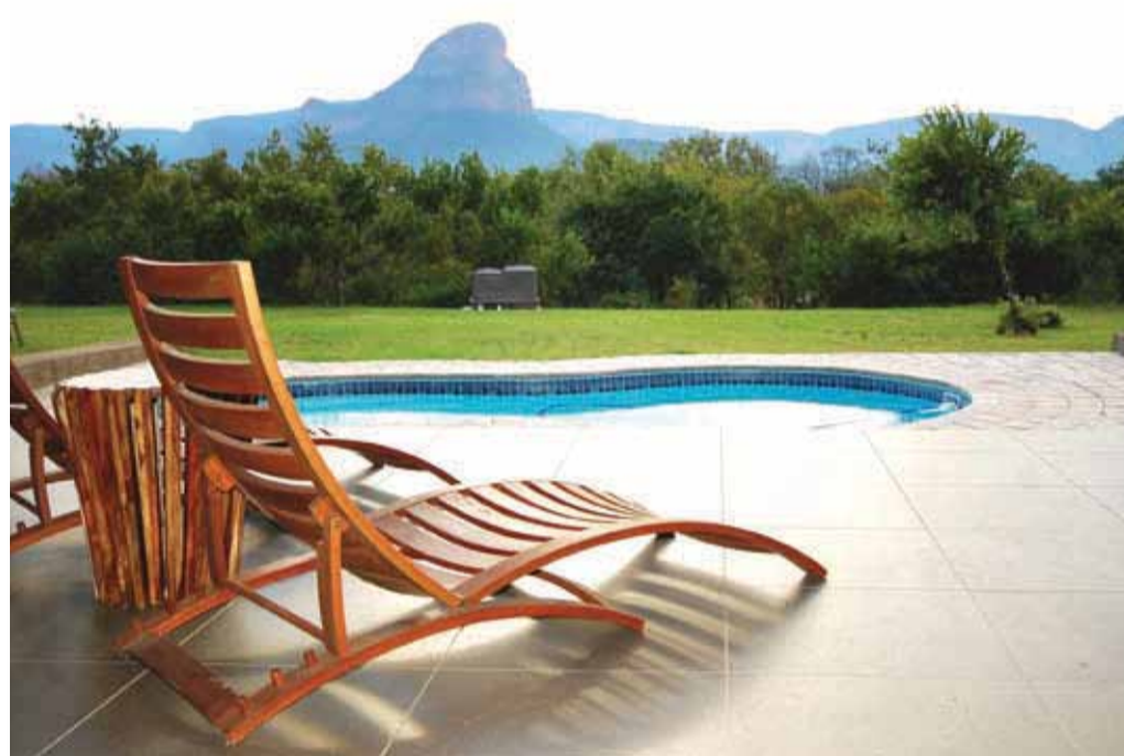
Mountain View Boutique Lodge with its breathtaking views, is one of the newest additions to the lodges at Entabeni Safari Conservancy.

For more information visit stand ICCP23 in Hall 4.